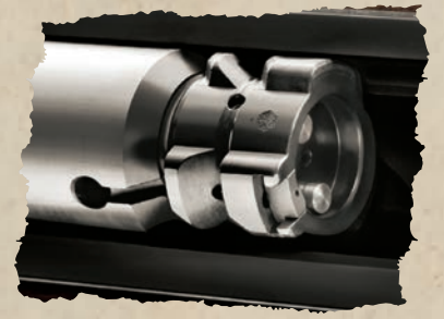
Direct lock-up inside the barrel

he MAUSER 12 has everything MAUSER represents: tough use in any condition. With a proven full steel construction, expertly designed cold-hammer forged barrel made of a specially formulated steel, locking of the bolt head inside the barrel with six massive lugs, detachable high capacity magazine and a safety concept that showcases what the MAUSER philosophy has been for more than a century. As time however does not stand still therefore, the MAUSER 12 optionally offers a precisely designed and manufactured manual cocking system that combines maximum safety and the easy and well known MAUSER-style operation. All these unquestionable advantages prove their truly uncompromising practicality, especially when unexpected circumstances force man and material to the limit and when compromise or defeat is not an option. It is then that a real hunting rifle must do its duty, when the last reserves are being used to conclude the adventure that was started hours or even days before.