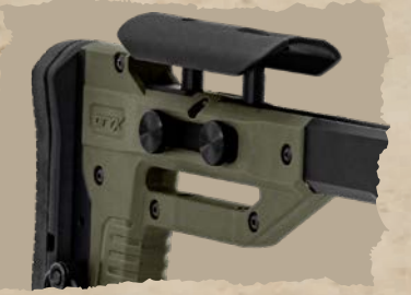
Optimized Oryx stock by MDT in Olive Dark Green