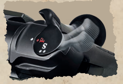
Optional manual cocking safety system